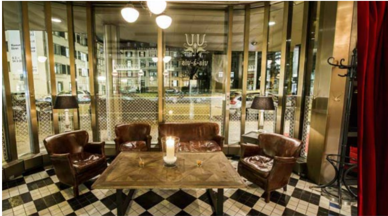
Elegance and splendour