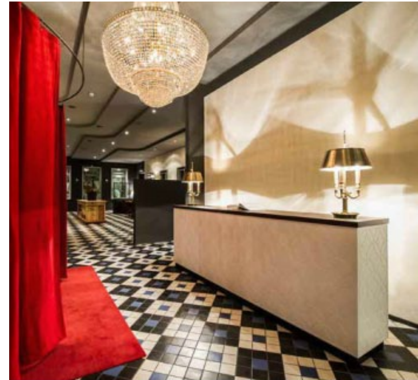
Vis a Vis lights up

Vis A Vis brings a multi functional venue to the marketplace that provides a place for people to dine throughout the day. Visitors can sample a wide selection of beverages and party late into the night as well as dine. The venue is a restaurant, bar and club combined.